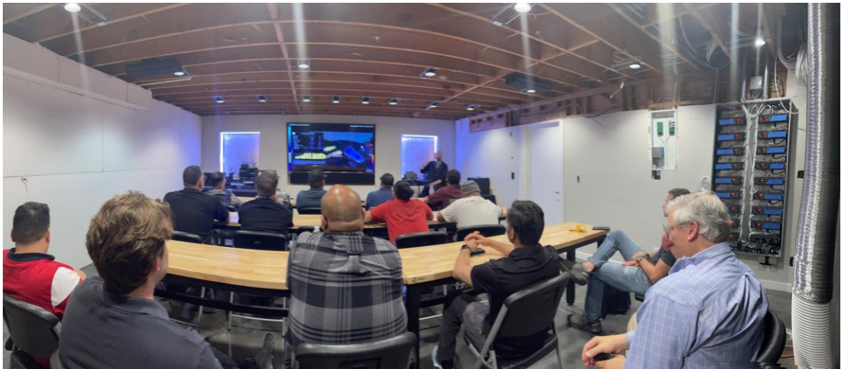
Full house for madVR Envy dealer training at ByDesign Ignite Event in Southern California.

Team madVR has been on the road again of late, showcasing the madVR Envy and conducting dealer trainings in Sothern California, Orlando and Ft. Lauderdale Florida, New Jersey and New York city. Up next? Austin, Texas on December 5, 2023 at the Embassy Suites by Hilton Round Rock. Be sure to come out and see us. Here are some of our favorite pictures from the road.