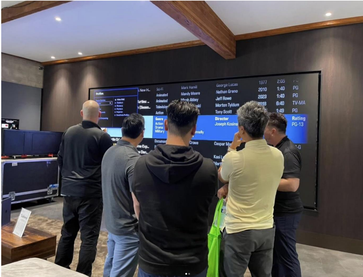
madVR Envy Extreme MK2 demo on the Barco Bifrost 16 FOOT WIDE 2.37 AR video wall.