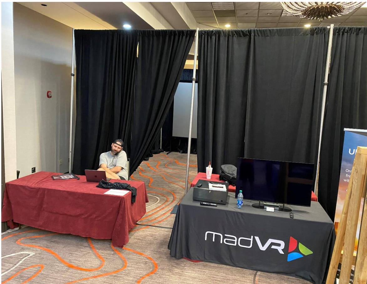
The calm before the storm on setup day (Ryan never misses a chance to take a support call).

The demos included a sneak peek at our upcoming AI-based, per-pixel motion interpolation, which was a huge hit. Stay tuned for more information soon on how you can meet with us for a personalized demo at our next big industry event.